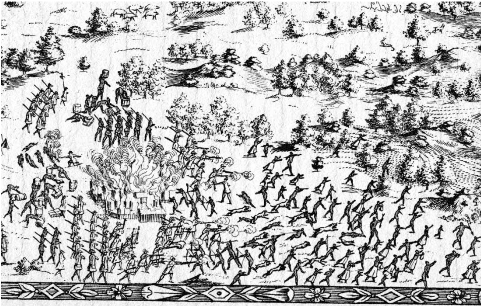
Figure 1 Detail of the Alexandre de Lavaux map of Suriname, 1737, with section showing colonial militia, enslaved porters, razing of a Maroon hamlet, fleeing Maroons with dogs in pursuit, and women possibly carrying bags of seed. Racial distinctions between whites and Blacks, enslaved as well as Maroons, are depicted with cross-hatching.

along the upper Suriname River. In this telling, rice symbolizes the abrogation of their subsistence rights in bondage.