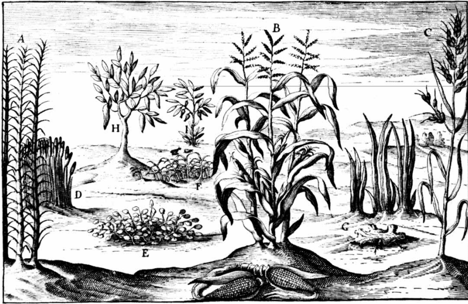
Figure 3 What spices and grains grow in this country, and what qualities or virtues they have, plate No. 13, Pieter de Marees, c. 150. Legend A – sugar cane, B – maize, C – rice, D – millet, E – cowpeas/black-eyed peas, F – fonio ( Digitaria exilis ), G – ginger, H – nééré ( Parkia biglobosa ), I – meleguetta pepper.

grown in Africa for the expanding European presence in West Africa (Figure 3). Included are the African meleguetta pepper, plants introduced to West Africa (sugar cane, ginger, maize), and the key African subsistence staples, rice, millet, cowpeas (black-eyed peas), fonio ( Digitaria exilis ), and nééré ( Parkia biglobosa ).